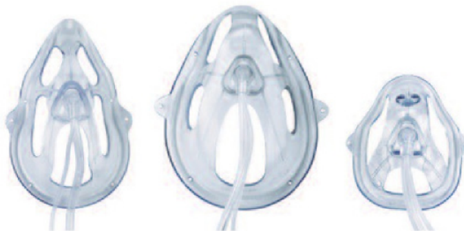
Oxy 2 Mask™ EtCO 2 Adult